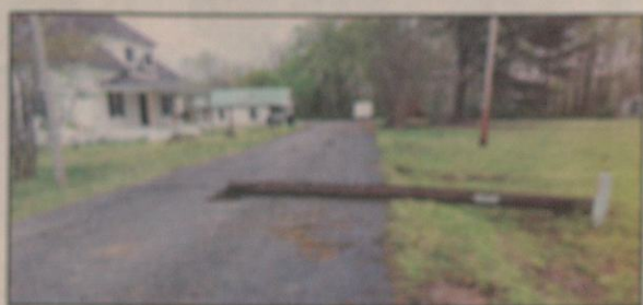
Utility pole still in street one week later