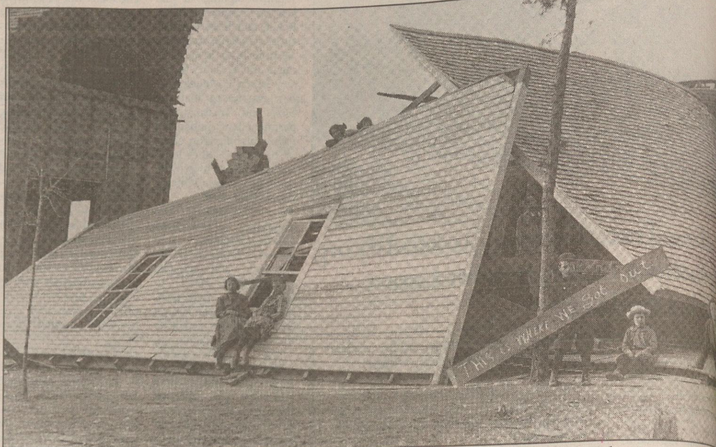
Tishomingo School was partially destroyed in windstorm - March 13, 1913

On March 13, 1913, the town was devastated when a tornado hit killing two people and causing much destruction for the little town.