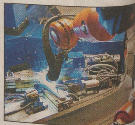
HAGO laser cutting machine at the Tishomingo County facility. HAGO is a supplier to BMW

located in Tishomingo County in 2015. Based in Kussaberg, Germany, the company has expanded the Iuka opera-