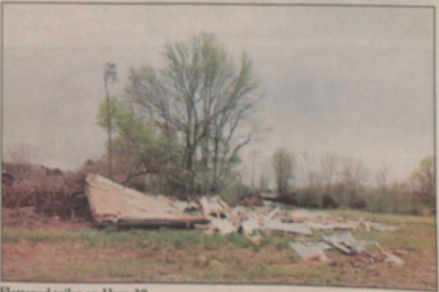
Flattened trailer on Hwy. 30