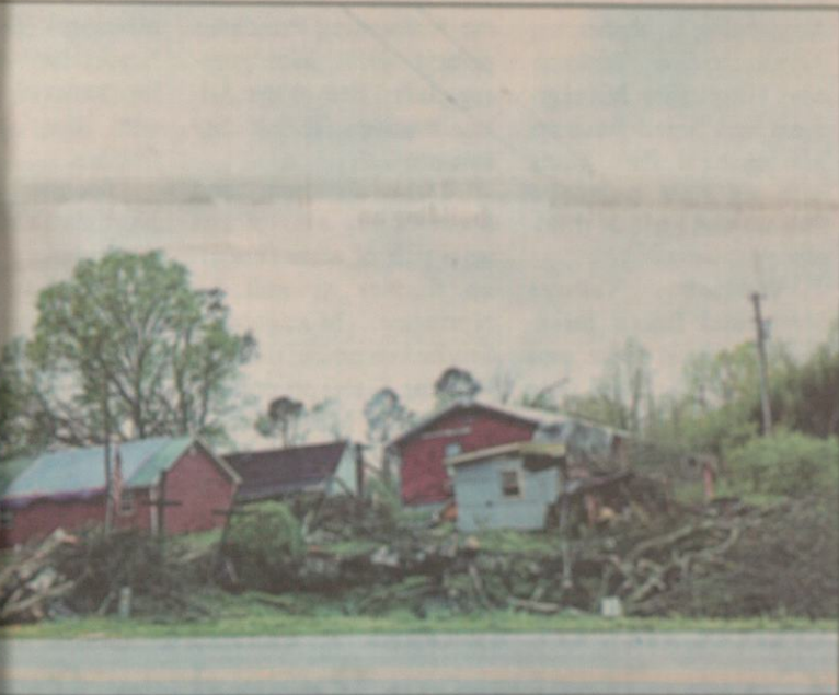
et Hwy. 25 going into Tishomingo.