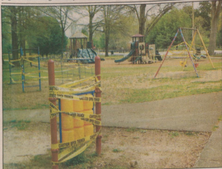
Iuka Mineral Springs Park is a sad site without the children! Walkers can continue to use the walking path at a safe distance, but all playground equipment is shut down until further notice.