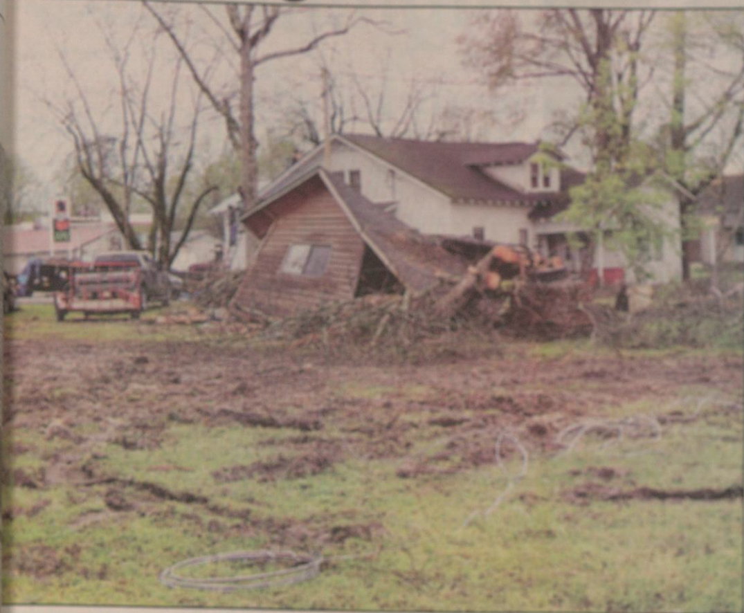
Damage throughout town