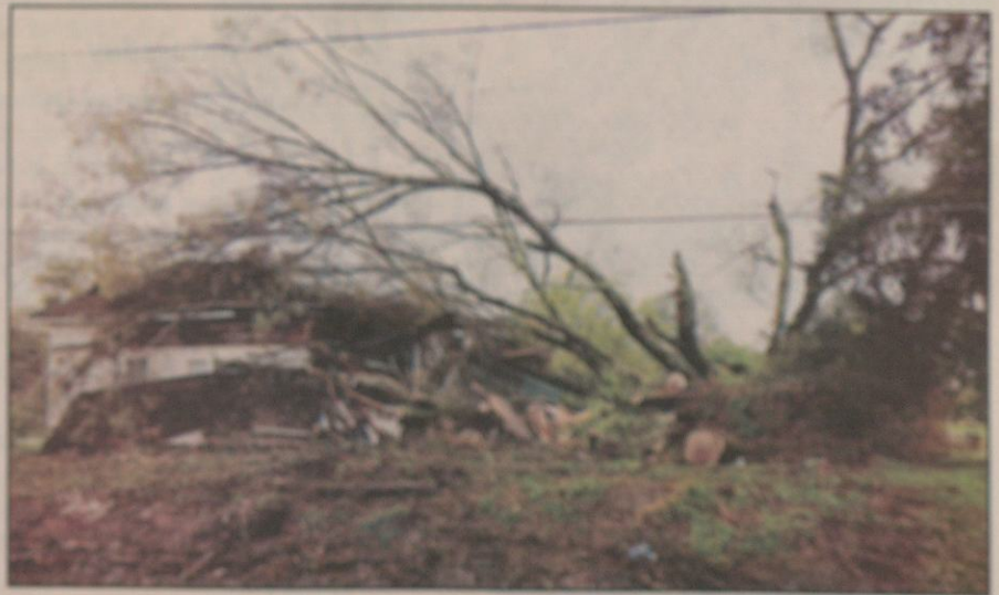
House in Tishomingo