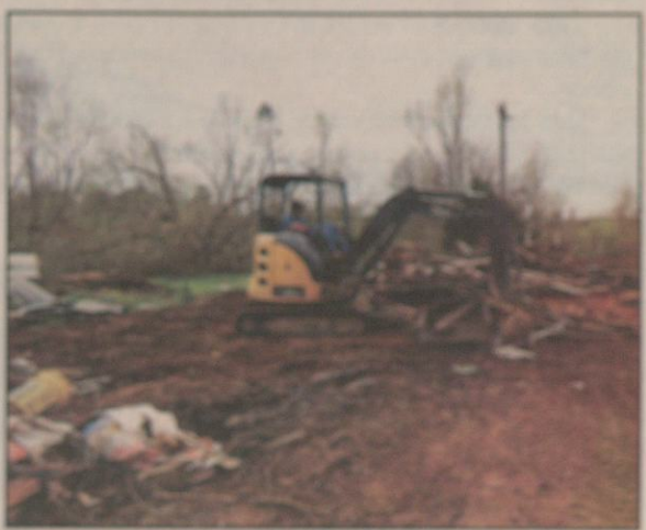
Clean up on Hwy. 30