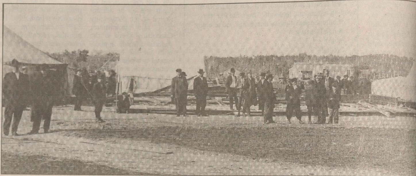
Recovery efforts begin on Main Street, March 1913